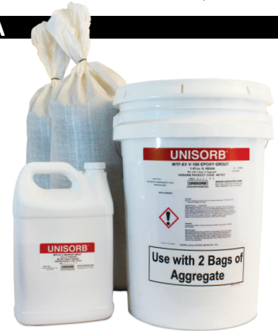
WTF-E V-100 EPOXY GROUT TYPICAL FIELD RESULTS